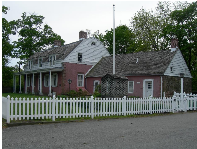
Figure 1- A modern view of the Schuyler-Colfax House. The 1690s, one-story portion of the home is seen on the right. The two story, 4-bay structure was added on in the 1780s. The home, as well as the farm that once surrounded it, were once supported by the labor of enslaved people.